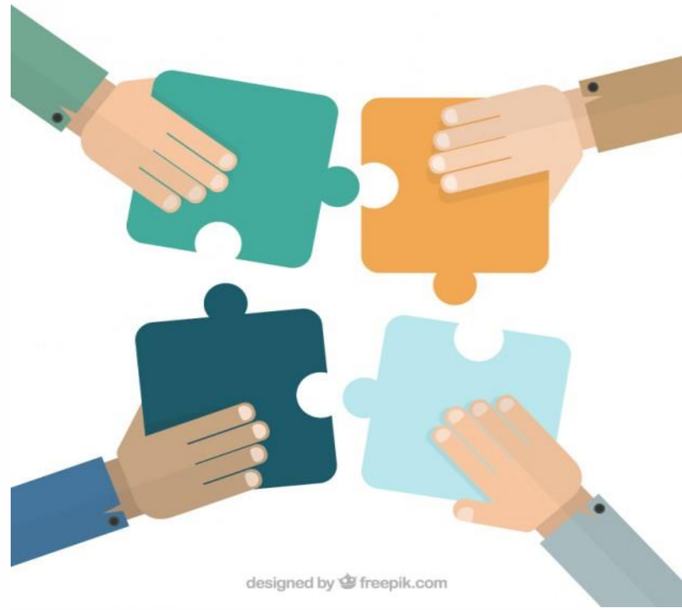
designed by freepik.com